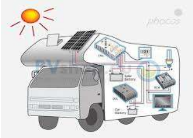
Figure 2: Solar bus

Solar buses: Solar buses are propulsed by solar energy, all or part of which is collected from stationary solar panel installations. The Tindo bus is a 100% solar bus that operates as free public transport service in Adelaide City as an initiative of the City Council. Bus services which use electric buses that are partially powered by solar panels installed on the bus roof, intended to reduce energy consumption and to prolong the life cycle of the rechargeable battery of the electric bus, have been put in place in China.